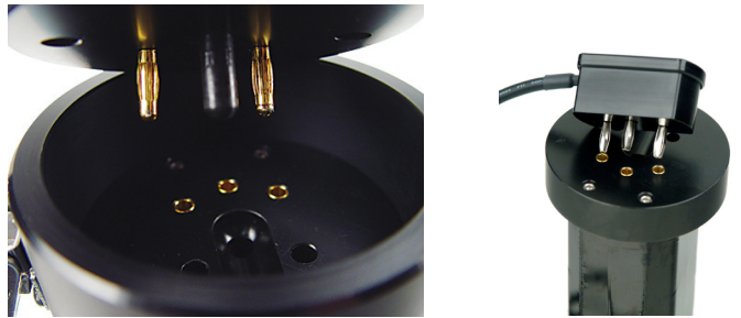
Engage the lid plugs with the battery cap's gold receptacles to provide power to the light (top). To charge the battery pack, push the charger's steel connectors completely into the battery pack's gold receptacles until the charger assembly rests on the lid (right).

may check the charge of your pack by disconnecting the battery and waiting for 3-5 seconds, reconnect the battery and see if the yellow light appears. For a fully discharged battery, the complete charging process should take approximately 1 hour for an Explorer/Eos 4.5 pack, 2 hours for an Explorer/